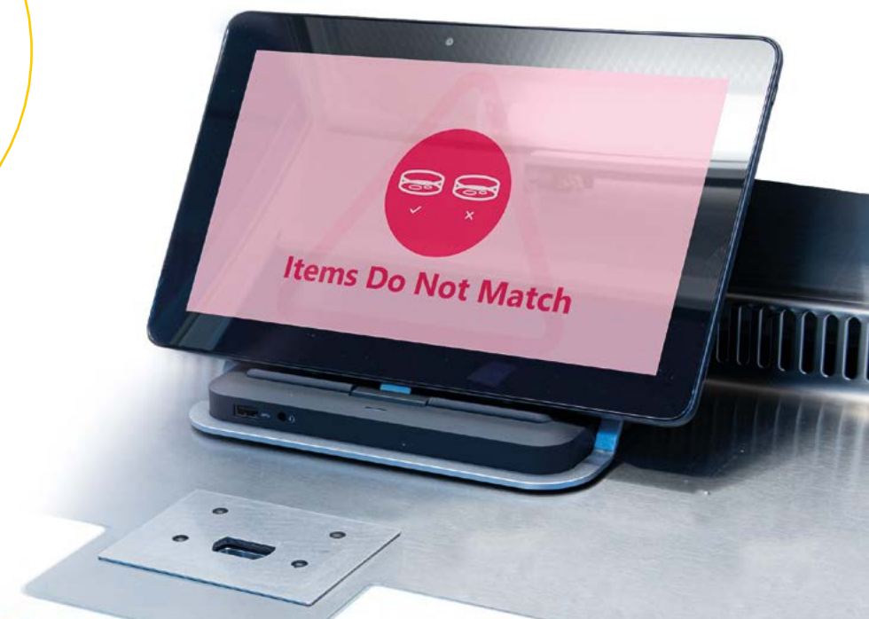
Work area tablet option (WIFI or LAN connections) on magnetic mount