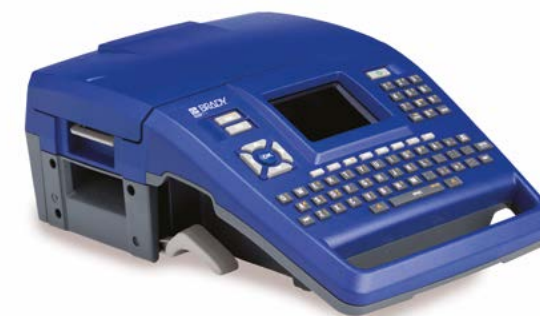
Label printer (BMP710)