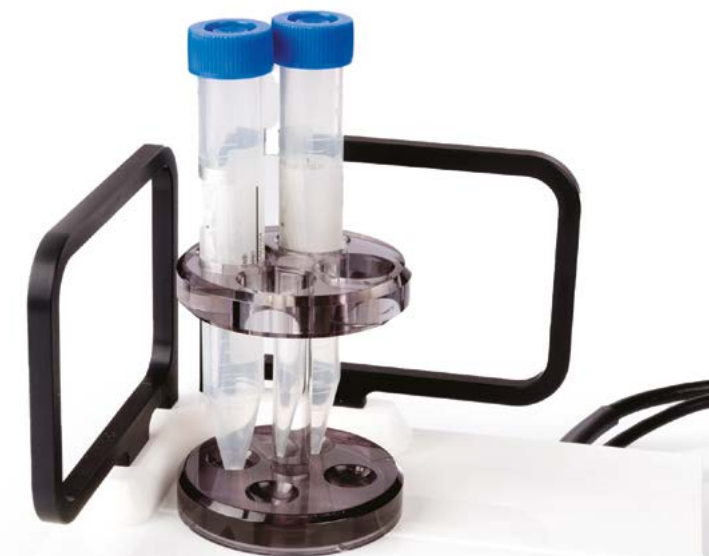
Tube reader accessory

An accessory for the Embryology Heated Plate, this tube reader enables the reading of RFID tags attached to test tubes, (maximum of four) and matches them with any tagged plasticware in the same work area.