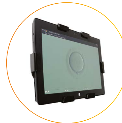
Work area tablet option (WIFI or LAN connections) on bracket mounted to stereozoom pillar

We recommend the use of Dell Latitude or Microsoft Surface tablet PCs for each RI Witness™ system work area inside your embryology and andrology labs. They have the advantage of comprising a PC and touch-screen monitor in one and can be mounted in flow cabinets in a variety of ways.