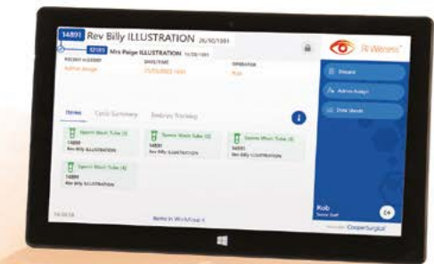
Sperm preparation work area