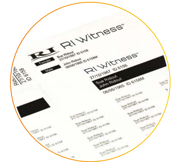
Patient identity label sheets available in 3 different designs (supplied in packs of 30)