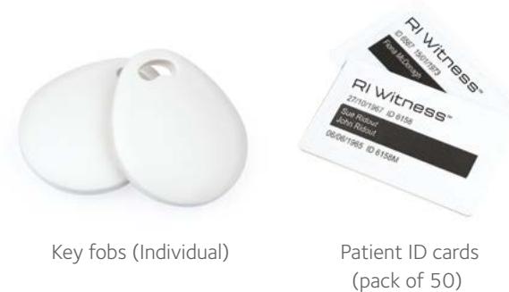
Key fobs (Individual)

The cards are provided blank on both sides and a label can be used from the patient identity label sheets or clinics can print their own.