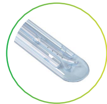
Sure-Pro supplied in a procedural tray to help maintain sterility while handling