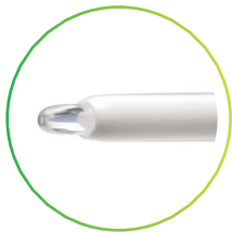
Soft hand-crafted tip designed to facilitate a smooth passage through the cervix