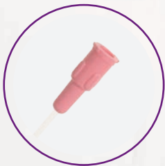
Luer lock compatible connections