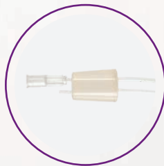
Available with luer lock at bung for intermittent flushing