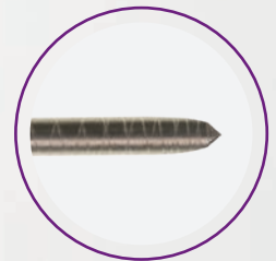
Echo markings at needle tip