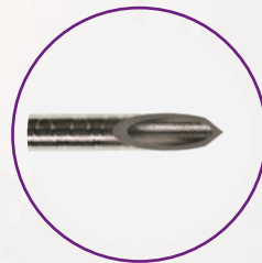
Triple-ground needle tip for optimum sharpness