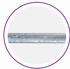
SureView micro bubbles are present throughout catheter length