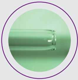
With fire polish